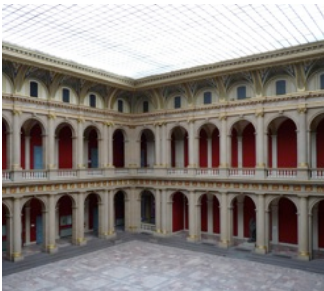
Palais Universitaire, Strasbourg